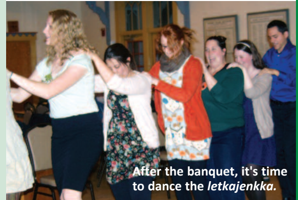
After the banquet, it's time to dance the letkajenkka .

Adults can also attend the Family Week, June 8–June 13, 2015, with a child, grandchild, niece, or nephew. Or take them to Family Fun Weekend, February 13–February 16, 2015.