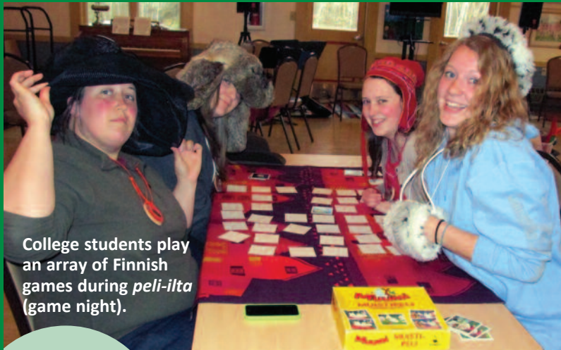
College students play an array of Finnish games during peili-ilta (game night).