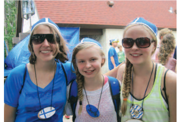
The väiskit and nimilaput identify Salolampi villager friends.