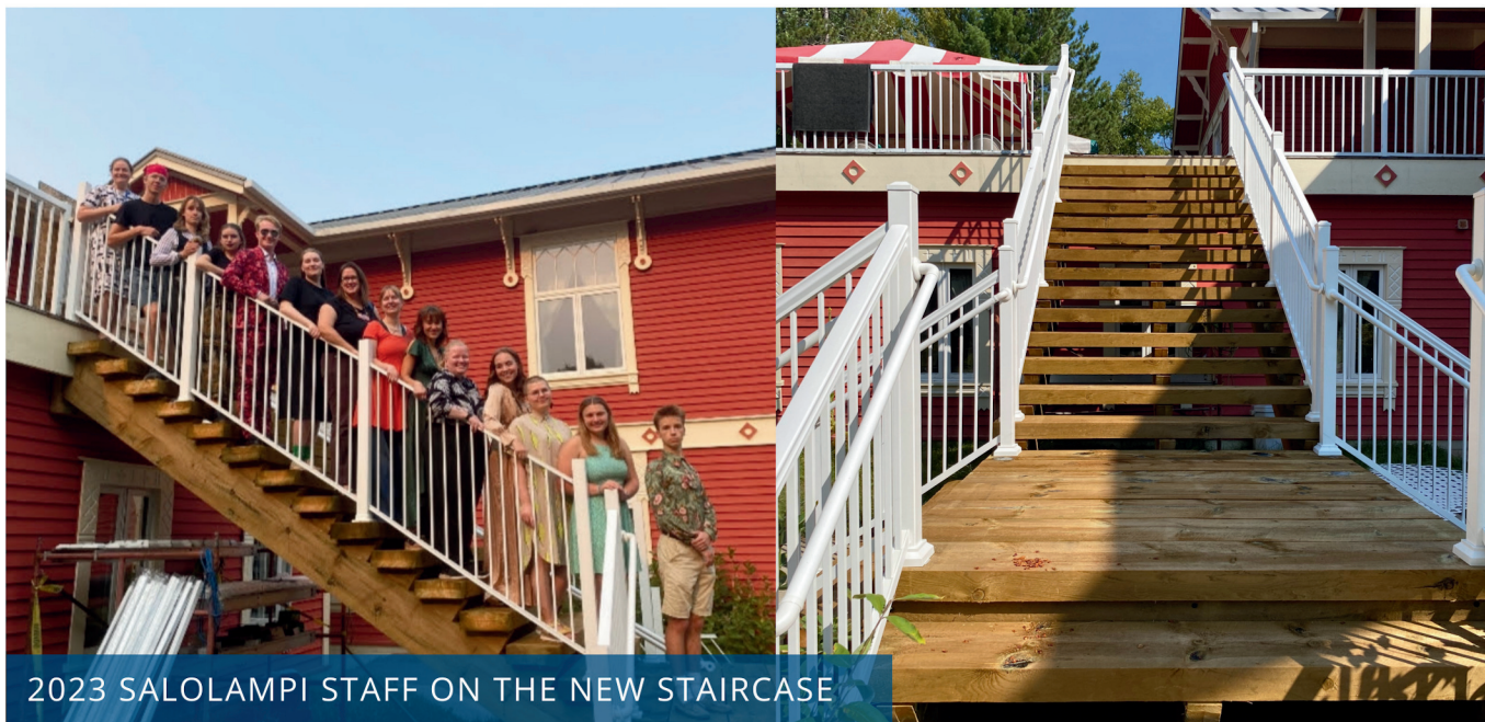
2023 SALOLAMPI STAFF ON THE NEW STAIRCASE

Finally, Salolampi is developing a collection of Finnish books in our library which are translated into English. These books will help even our newest language learners access the stories that Finnish youth and adults read. To support this and other items we would love to have, we have created an Amazon wishlist. Items will be shipped directly to Salolampi. Visit https://a.co/cGtePtk to access the Salolampi wishlist.