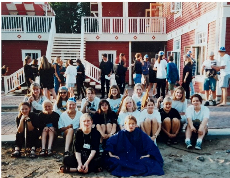
VILLAGERS SUMMER 1993