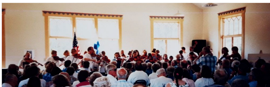
MUSICAL PERFORMANCE DURING SITE DEDICATION